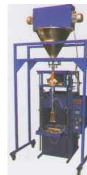
AF-35-OB automatic weighing-and-packing machine with a volumetric dosing unit