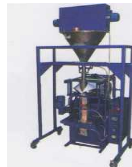
AF-50-OB automatic weighing-and-packing machine with a volumetric dosing unit