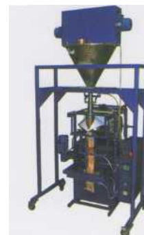
AF-45-OB automatic weighing-and-packing machine with a volumetric dosing unit