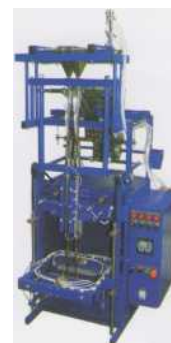
AF-120-OM automatic weighing-and-packing machine with a volumetric pendulum dosing unit