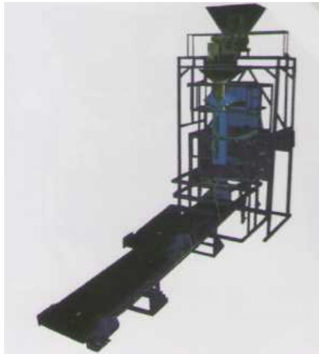
AF-10-OB automatic weighing-and-packing machine with a volumetric dosing unit