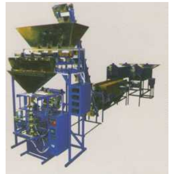
ALZHUS-30 semiautomatic production line