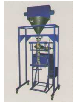
PAF-35-OB semiautomatic weighing-and-packing machine with a volumetric dosing unit