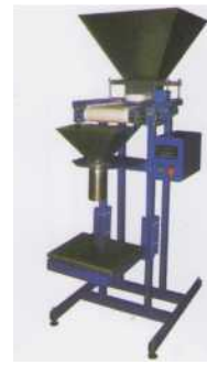
VD-1 weighing dosing unit